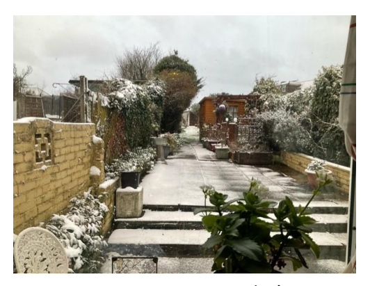
Carol O'Connor Snowy Garden