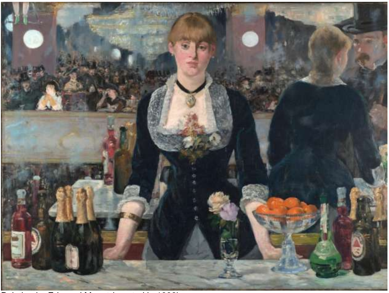
Painting by Edouard Manet (created in 1882)